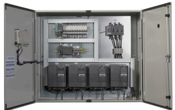
UL508A Industrial Control Panel