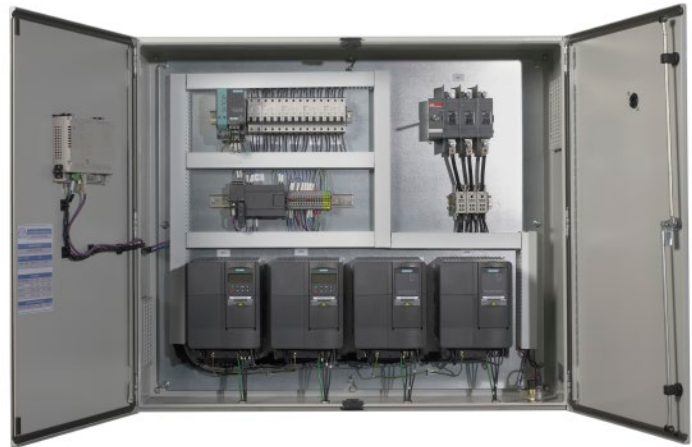
UL508A Industrial Control Panel